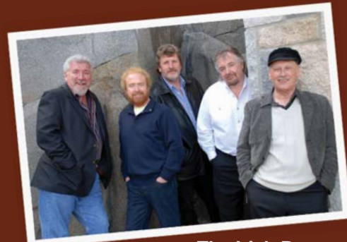
The Irish Rovers December 6, 2008