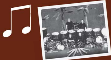
Caribbean Sound April 18, 2009