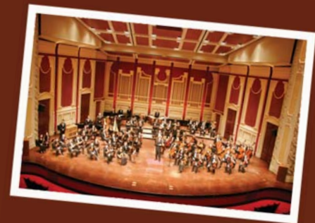
Pittsburgh Youth Symphony Orchestra November 1, 2008

Your participation will be an investment that will provide a significant return to your company and to your community.