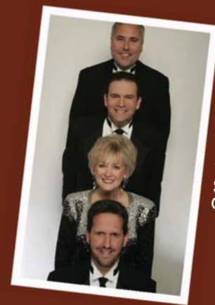
The Pied Pipers with The Clambake Seven October 4, 2008