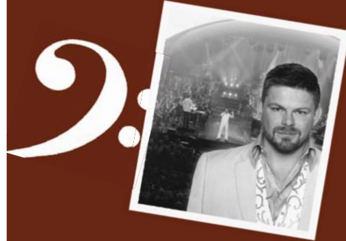
Stig Rossen, star of "Les Miserables" March 7, 2009